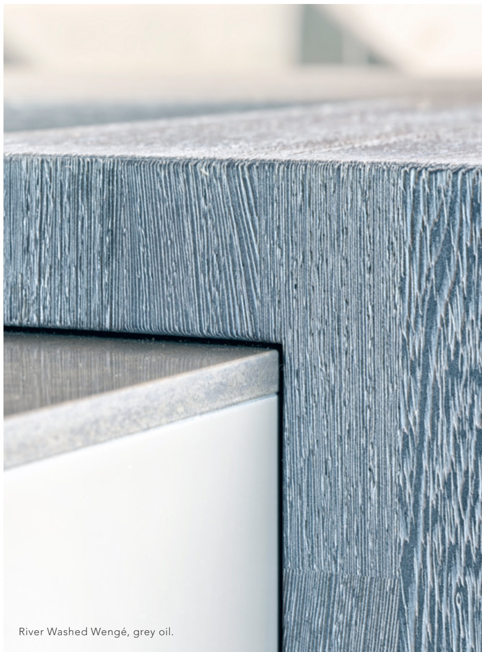
River Washed Wengé, grey oil.